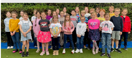
The Junior Choir

The choir had its first outing when it sang at the family service in church in October and the children were really great! The choir is due to sing again on the 19th November and has also been invited to sing at the Parish Lunch on the 12th December.