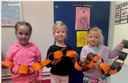
making some Hallowe'en decorations

It's fantastic to see so many children cycling and scooting to school! There are racks at the back of the school where bikes and scooters can be left safely during the school day. Since there are lots of little people in the yard at the beginning and end of the school day, please make sure that children walk with their bikes and scooters in the yard to keep everyone safe. Also we recommend that children wear helmets when on the move.