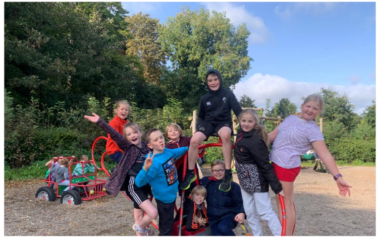
5th Class having fun after competing in Orienteering before mid-term

Prior to mid-term the PTA organised a Movie Night in school for all the classes. Everyone dressed up in their Hallowe'en costumes and watched a movie with their friends while munching on some goodies! It was great fun and most enjoyable. A huge thank you to the PTA and the staff who helped out on the night.